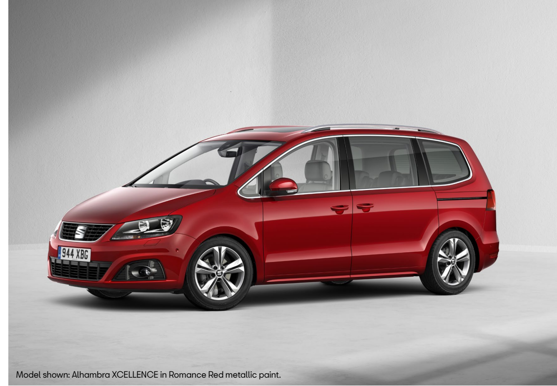
Model shown: Alhambra XCELLENCE in Romance Red metallic paint.

*Price is for Alhambra XCELLENCE 2.0 TDI Ecomotive 150PS.