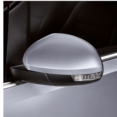
Moonstone Silver 2