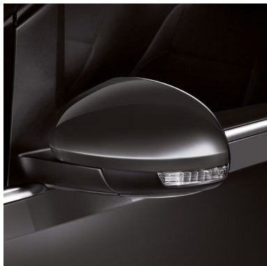
Urano Grey 1