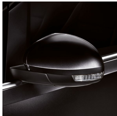
Deep Black 2