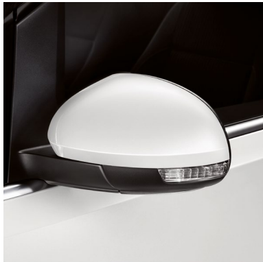
Pure White 1

Print and screen view do not provide an exact representation of colour. Please refer to the paint colour moulds at your local SEAT Dealer.