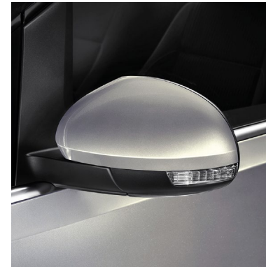
Reflex Silver 2