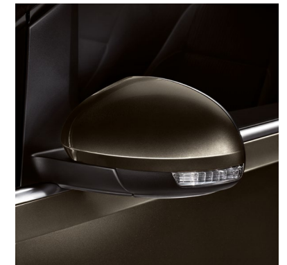
Black Oak Brown 2