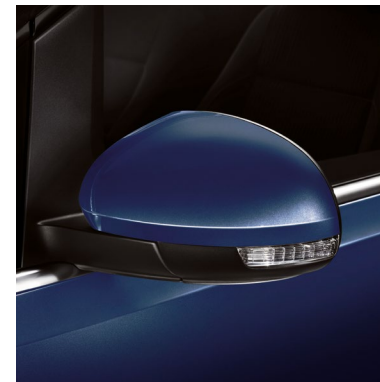
Atlantic Blue 2