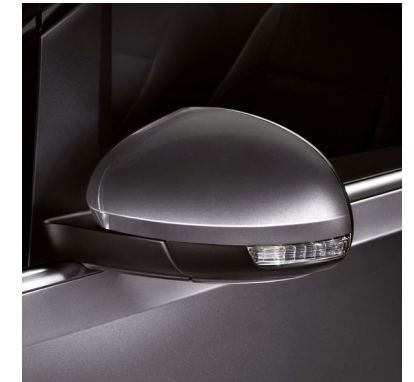
Indium Grey 2