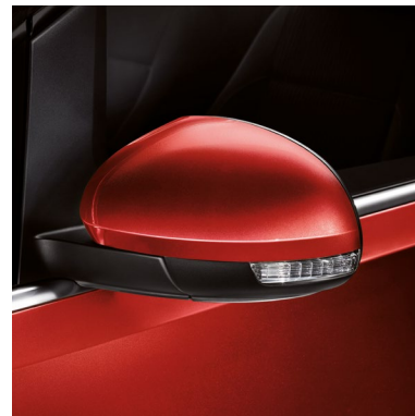
Romance Red 2