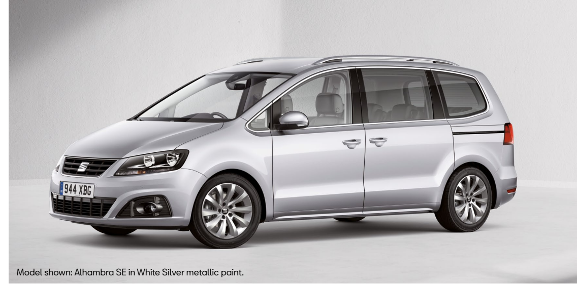
Model shown: Alhambra SE in White Silver metallic paint.

Get the family out and about in style and safety – with 17" 'Dynamic' alloy wheels, dark tinted rear windows and cruise control. Plus, the handy coming & leaving home headlight feature illuminates the area around the car, making it easier for everyone to get in and out on those dark evenings.