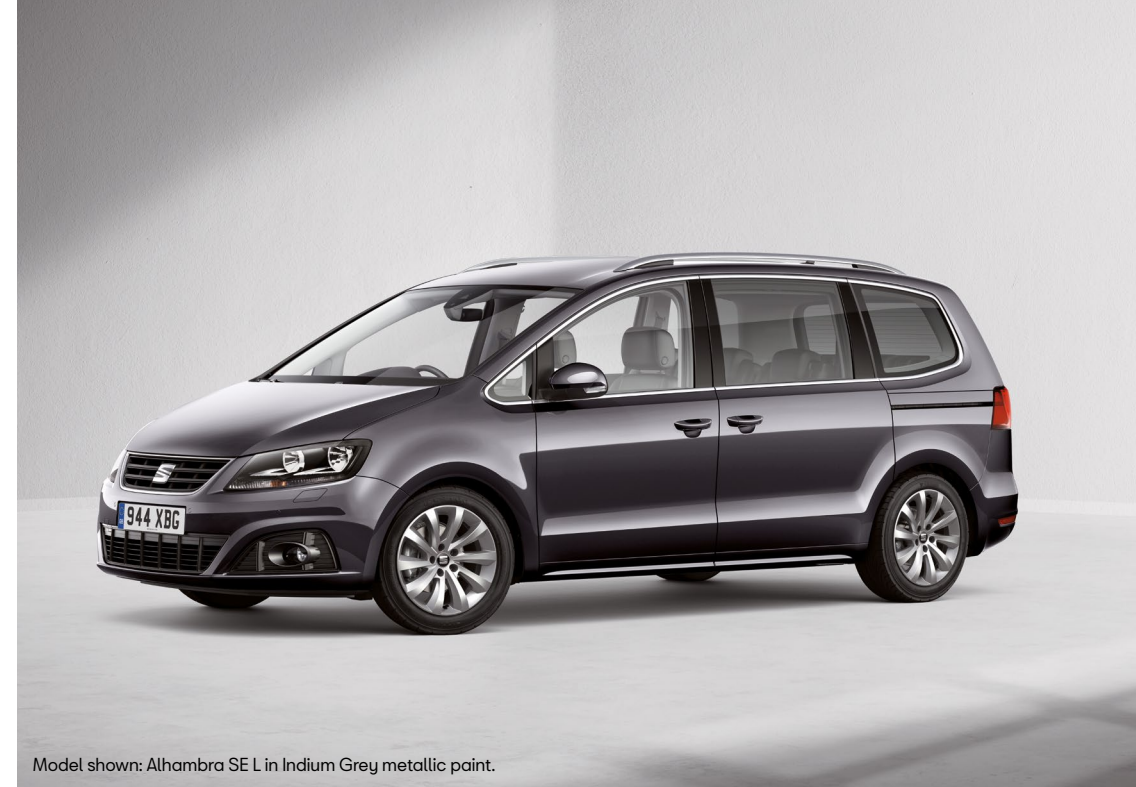
Model shown: Alhambra SE L in Indium Grey metallic paint.