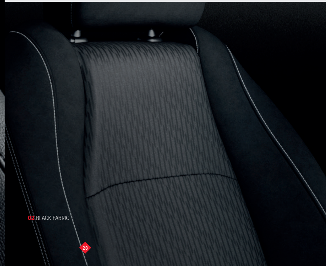
02 BLACK FABRIC