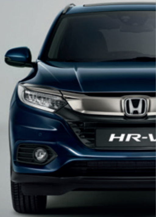
MIDNIGHT BLUE BEAM METALLIC

Express your personality and choose from our range of colours that complement the HR-V's dynamic styling perfectly. Among them are two exciting new colours, Midnight Blue Beam Metallic and Platinum White Pearl.