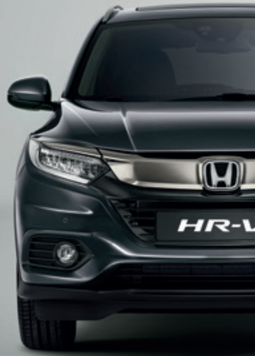
MODERN STEEL METALLIC