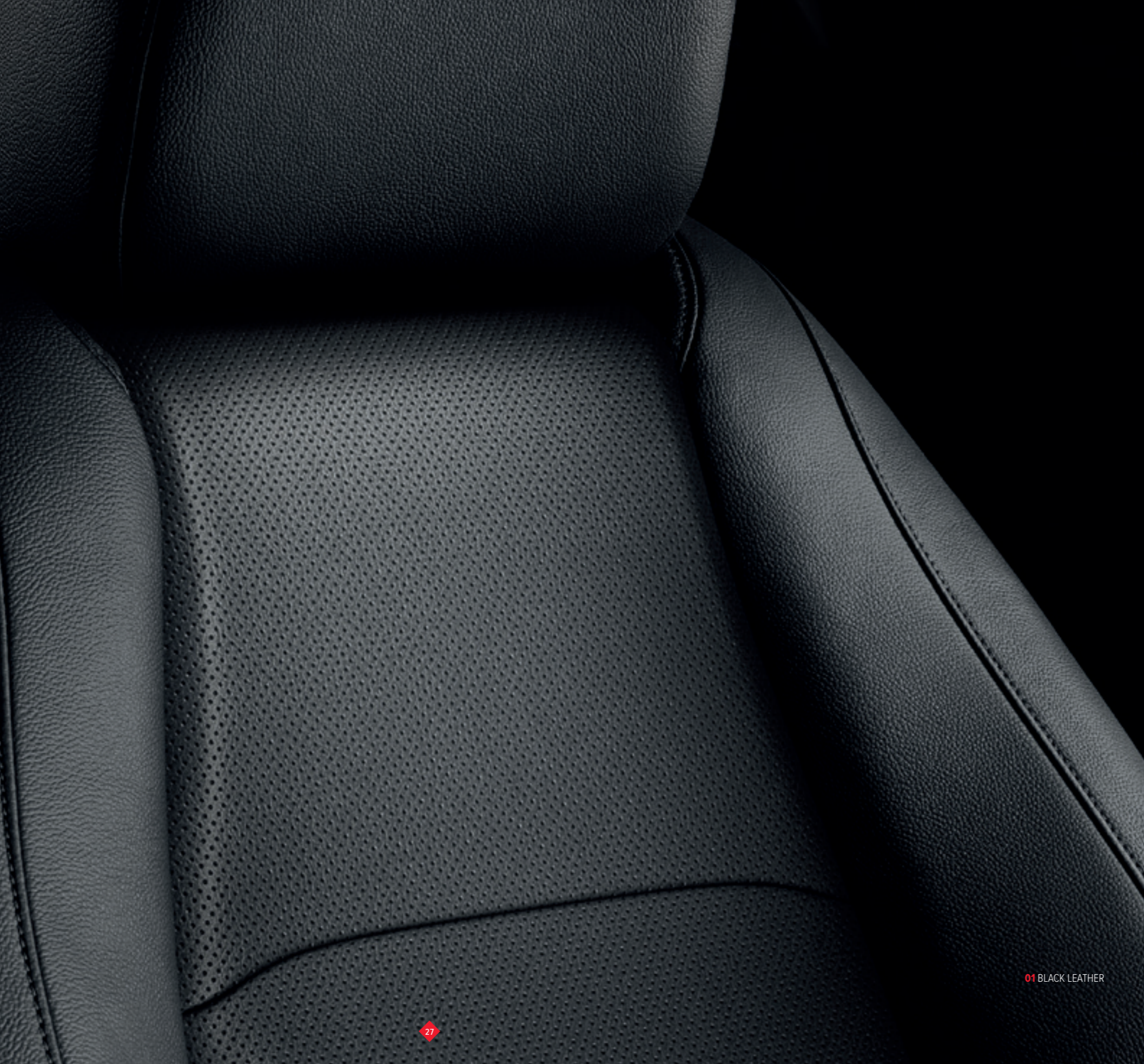
01 BLACK LEATHER