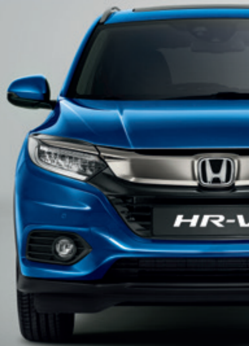
BRILLIANT SPORTY BLUE METALLIC

Models shown are HR-V 1.5 i-VTEC EX. Images are shown for illustration purposes only and show a left hand drive vehicle. In the UK, the HR-V will be a right hand drive vehicle.