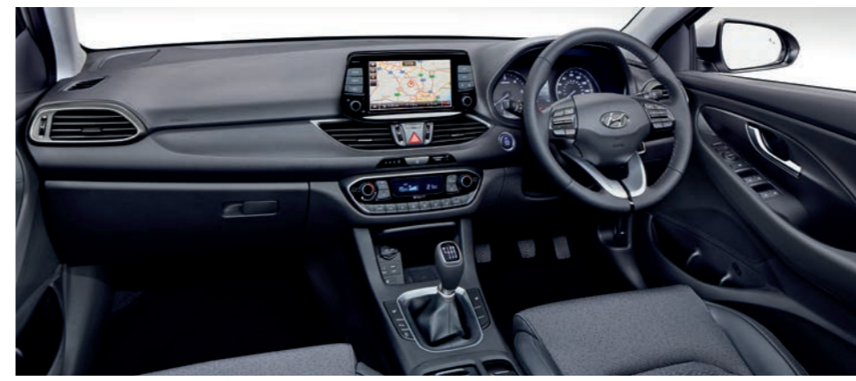
Black Trim Available on i30 Hatchback.