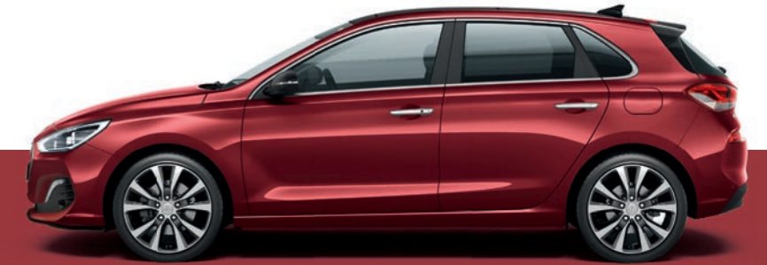
Fiery Red – Metallic