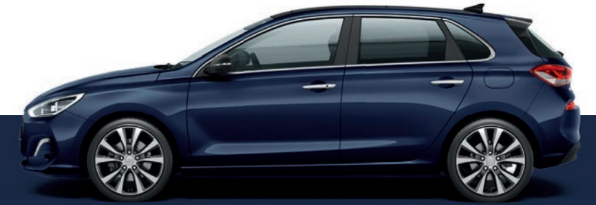
Stellar Blue – Metallic