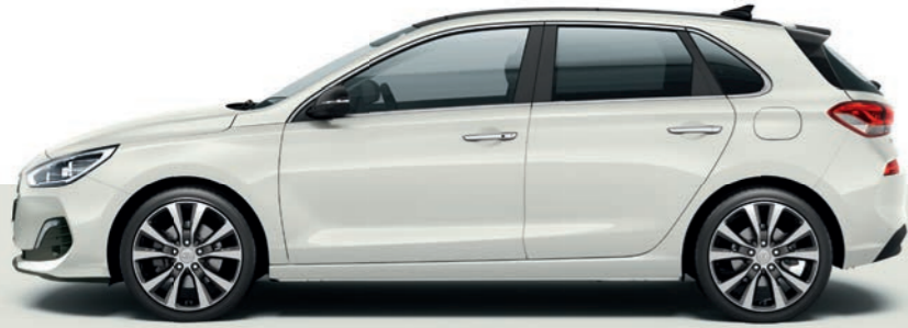
Polar White – Solid