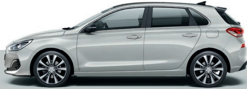
Platinum Silver – Pearl