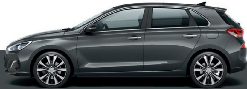
Micron Grey – Metallic