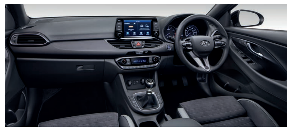
Black Faux Leather and Suede Trim Available on i30 N Line +.