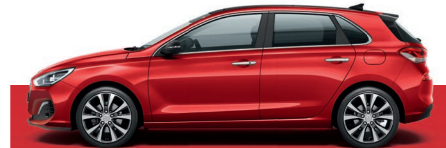
Engine Red – Solid