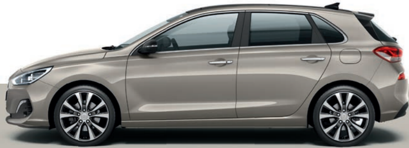
White Sand – Metallic