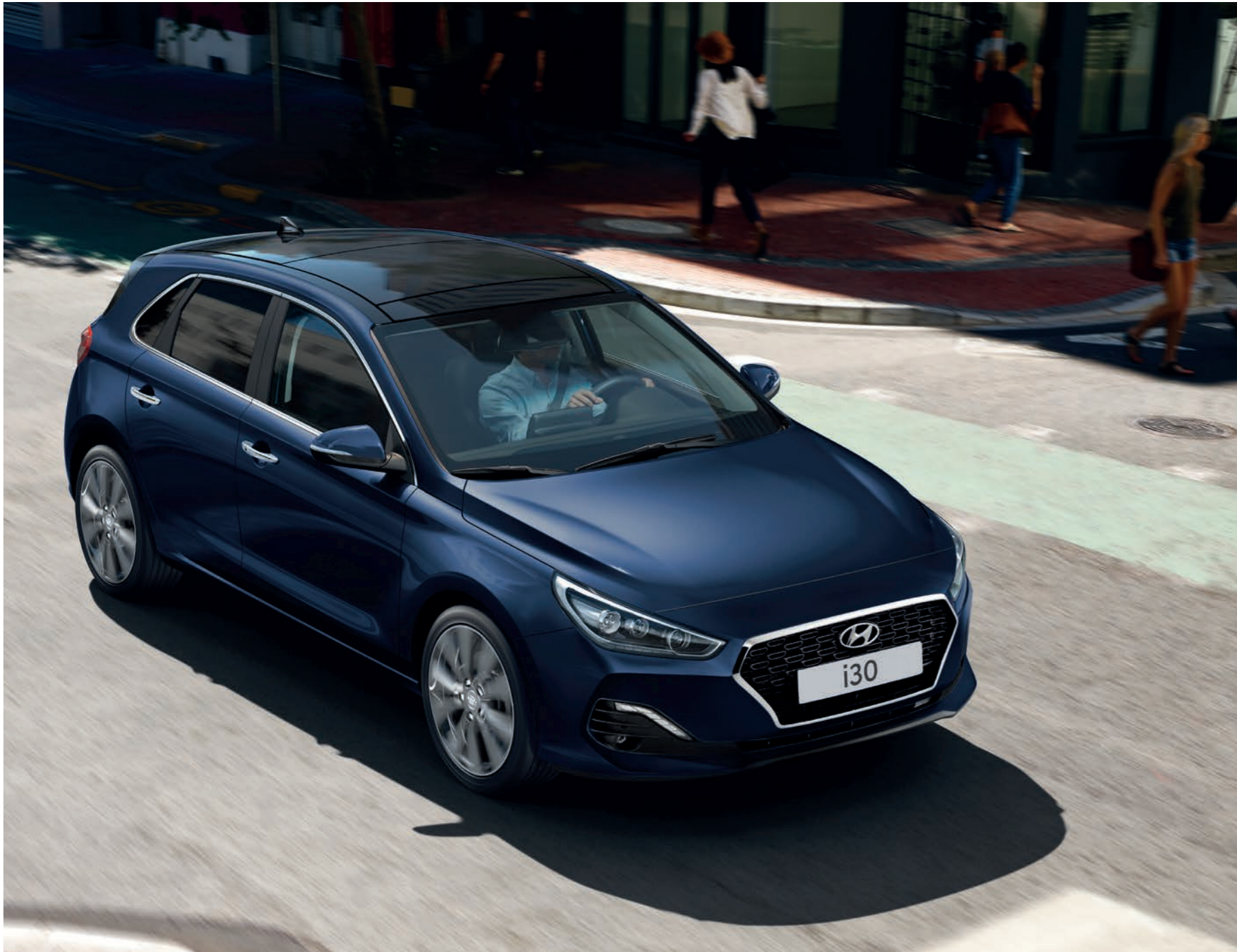
Car shown i30 Hatchback Premium SE in Stellar Blue metallic paint. Not to UK specification. i30 Hatchback Premium and Premium SE will include body coloured door handles from April 2019.