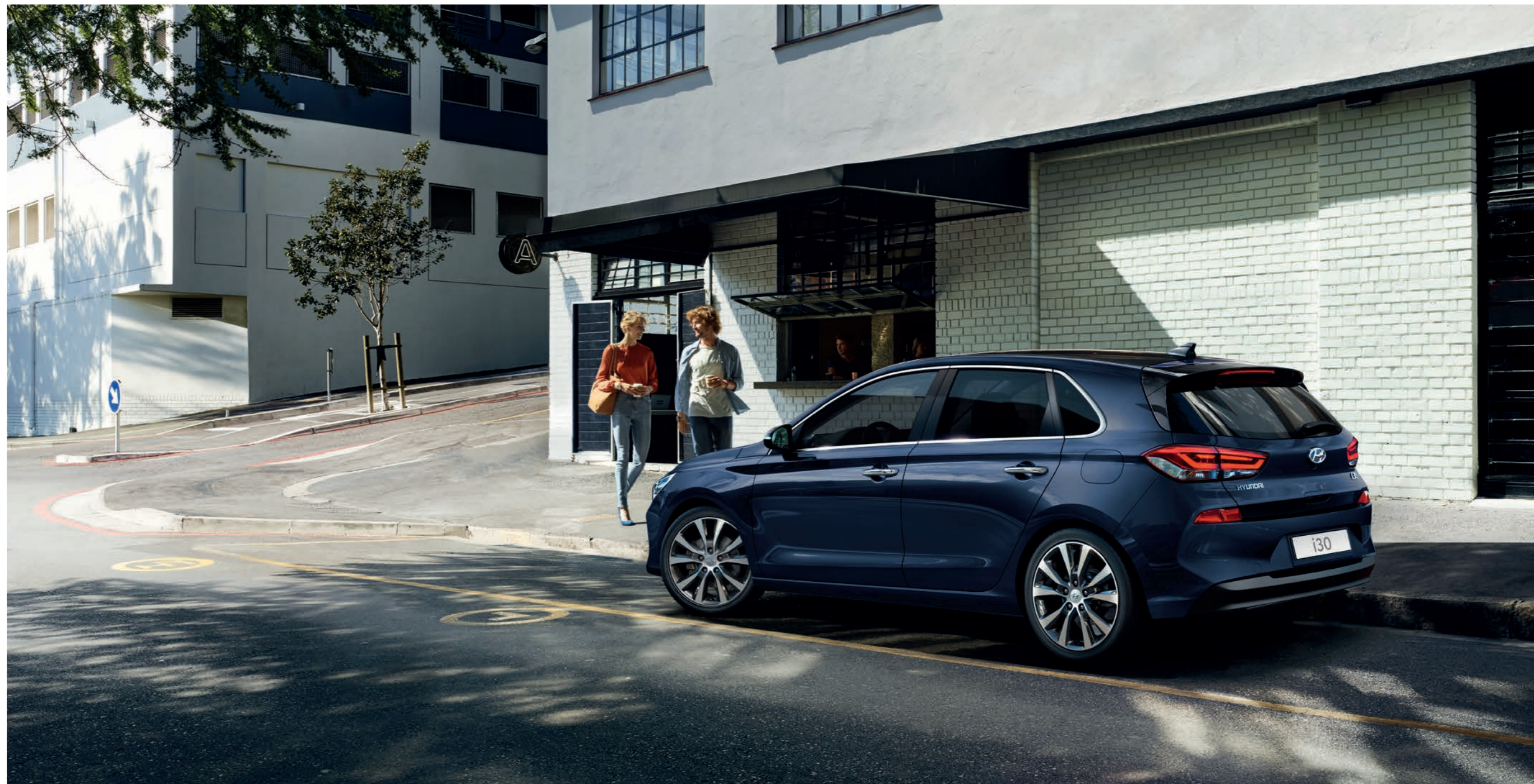
Car shown i30 Hatchback Premium SE in Stellar Blue metallic paint. Not to UK specification i30 Hatchback Premium and Premium SE will include body coloured door handles from April 2019.

Timeless design, advanced connectivity and comprehensive safety technologies. The i30 range delivers on every level.