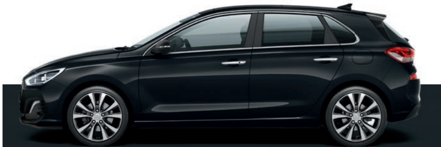
Phantom Black – Pearl