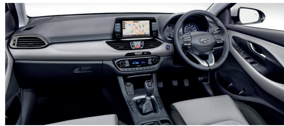
Two-tone Black/Grey Trim Available on i30 Hatchback.