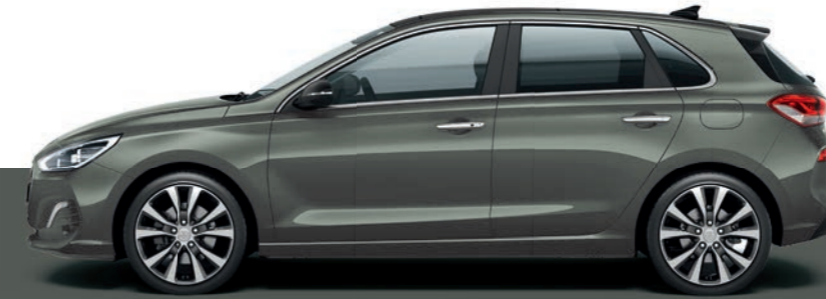
Olivine Grey – Metallic