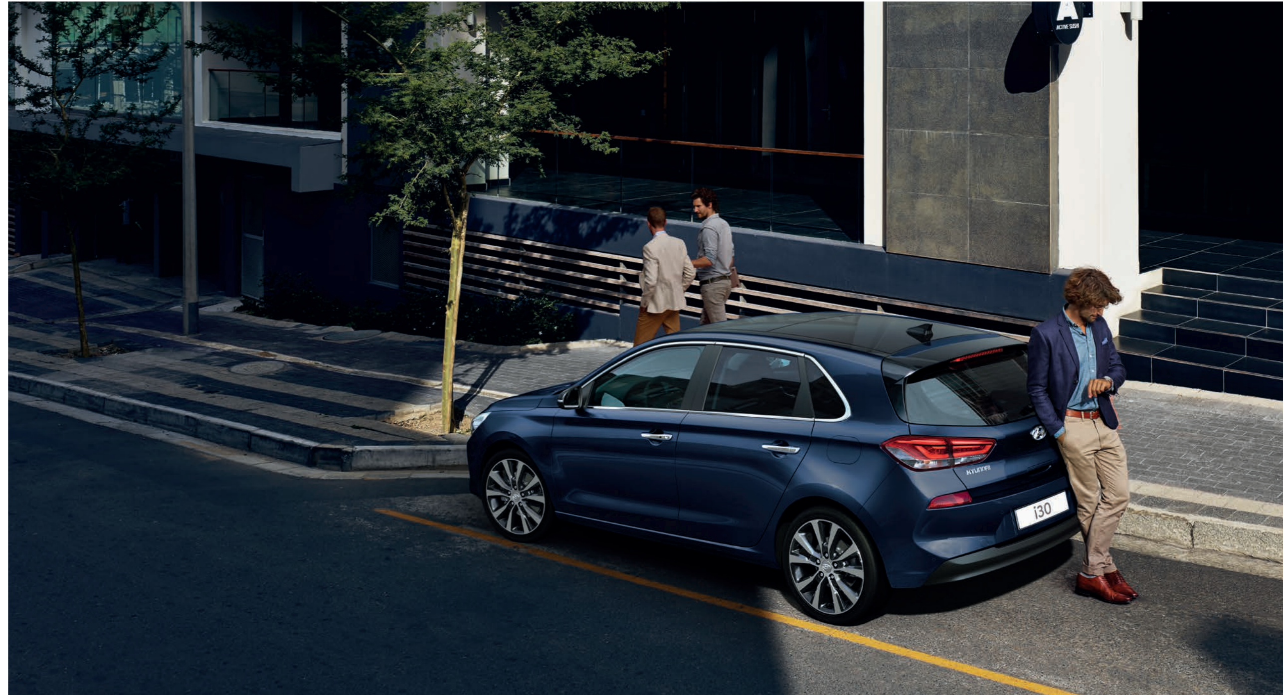
Car shown i30 Hatchback Premium SE in Stellar Blue metallic paint. Not to UK specification. i30 Hatchback Premium and Premium SE will include body coloured door handles from April 2019.

The structure of the i30 was created using weight-saving Advanced High Strength Steel (AHSS). Its impressive level of innovation doesn't stop there - thanks to turbocharged engines, which have been ingeniously engineered not only for enhanced throttle response and low-end torque, but also for lightness. Compared with its predecessor, it saves 28kg in body weight - allowing you to go further between fuel stops.