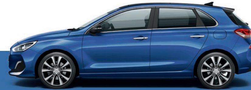
Champion Blue – Metallic*