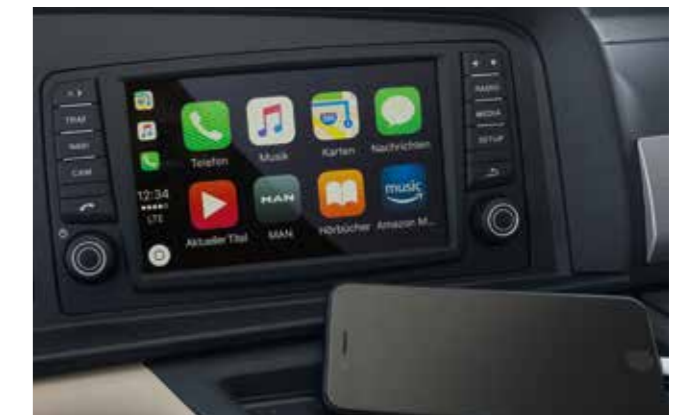
Function "Mirror Link"