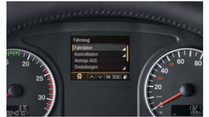
Enhanced colour display in the instrumentation

Comfort and working conditions for the driver have been improved thanks to the reduction in interior noise by 1.5 dB compared to the previous series.