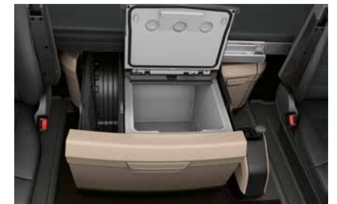
Coolbox/stowage box pulled out