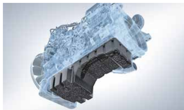
Plastic oil sump to save weight