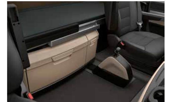
Stowable coolbox/stowage box

The new coolbox/stowage box with integrated bin can be stowed fully under the bunk. A handy tray can be placed on the box or stored separately, providing a lot of extra space and some comfortable legroom when sitting on the bunk. Nevertheless, the new layout still offers more cooling space and additional storage compartments. The feature that allows cups or ashtrays to be placed on the top has also been optimised: up to four retaining devices can be fixed in the middle, within easy reach of the driver and co-driver.