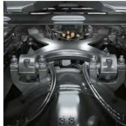
Weight-saving X control arm on the rear axle takes over the stabiliser and control arm functions

Furthermore, the X control arm combines the wishbone and the stabiliser into one component, delivering not only superior ride stability and tracking, but also reducing vehicle weight to enable more payload to be carried.