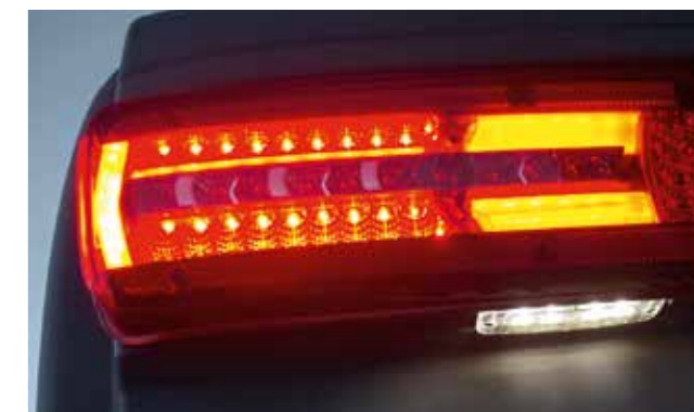
LED rear lights

Early recognition of critical situations on the difficult-to-view right side of the vehicle is essential when turning or manoeuvring. A camera on MAN trucks extends the visible area to the blind spot. The monitor is in the field of vision when looking to the right in the mirror and helps the driver to better view the area next to the vehicle. It recognises whether, for example, cyclists or smaller vehicles are located directly next to the driver's cab and, when manoeuvring, obstacles stand out better. The system is activated automatically whenever the right-hand indicator is switched on. This equipment can be ordered ex works.