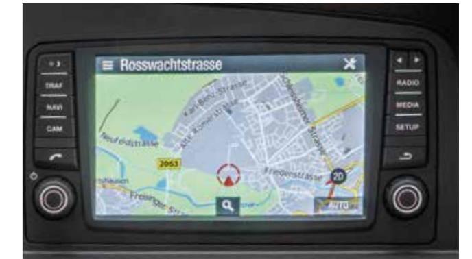
MAN Media Truck Navigation

The new "Mirror Link" function transfers the user interface of mobile devices to the infotainment system, enabling safe operation via the multi-function steering wheel and the system itself (connection via USB cable). The navigation screen also continuously shows maximum speed limitations (dependent on the map data including the respective information). The digital radio (DAB/DAB+) is easy to access and use via voice control.