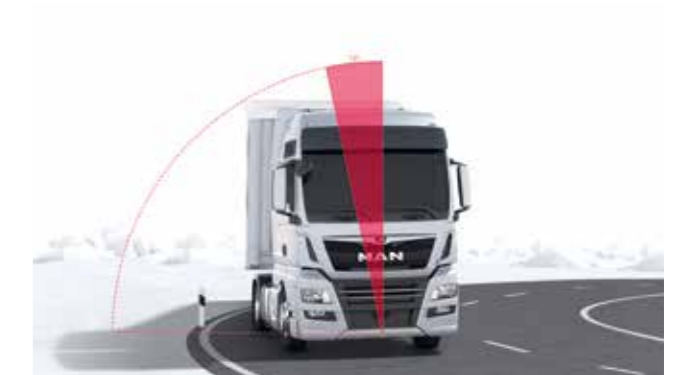
Vehicle behaviour with CDC

With active roll stabilisation, dampers are automatically regulated by the CDC (Continuous Damping Control). This prevents the development of rolling or pitching movements, and thus makes driving safer. For vehicles with high centres of gravity, high-load roll stabilisation with an additional X control arm is ideal. This ensures that sideways tilting is effectively reduced.