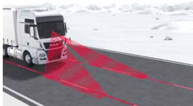
Lane Guard System (LGS) including Lane Return Assist (LRA)