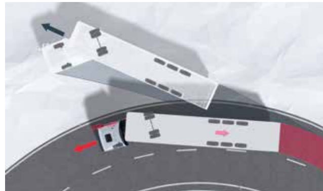
ESP compensatory braking when vehicle is oversteered

As even a brief moment of distraction can lead to an accident, MAN has developed the anticipatory Emergency Brake Assist (EBA). It gives drivers an advance warning of impending collisions, providing them with valuable time to react. The system automatically initiates braking in an emergency. The optimised Emergency Brake Assist (EBA) features a more advanced traffic monitoring system by using two independent sensor systems (radar and video) to detect a potential collision more quickly and to issue a warning signal as early as possible.