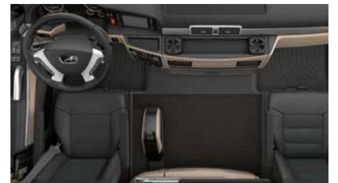
Rearranging the TipMatic switch and parking brake creates additional space