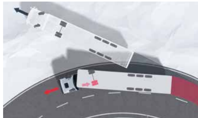
ESP compensatory braking when vehicle is understeered