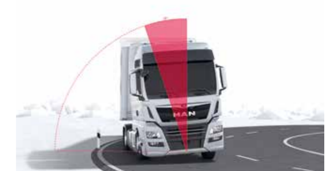
Vehicle behaviour without CDC