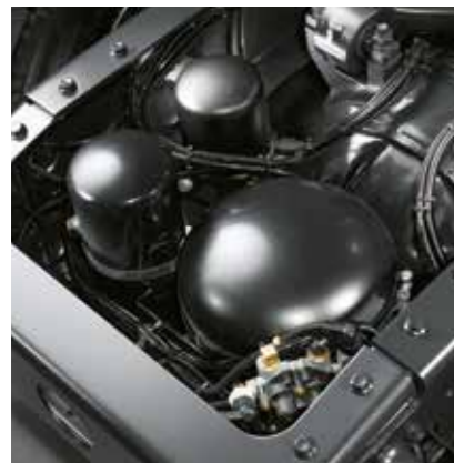
Compressed air tanks situated at the rear