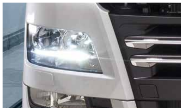
LED daytime driving lights