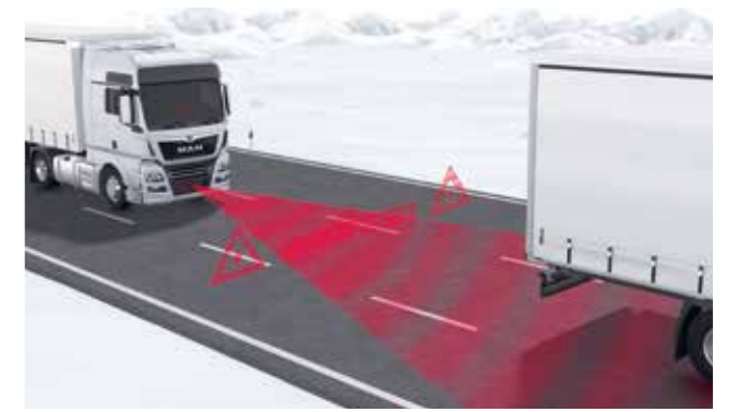
Functional principle EBA: advanced traffic monitoring by using two independent sensor systems (radar and video)