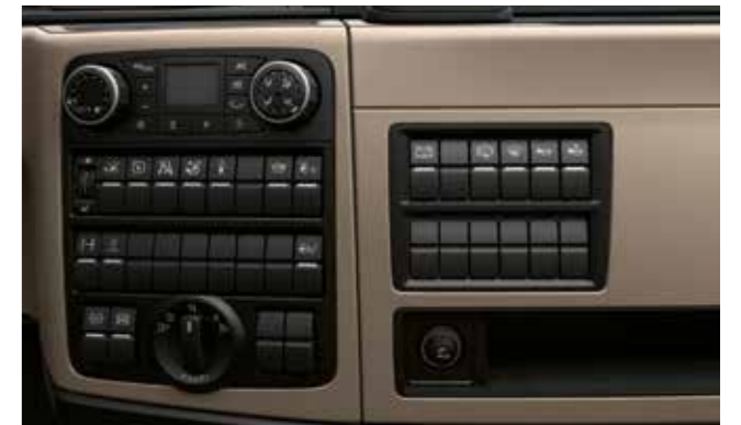
Neat switch layout