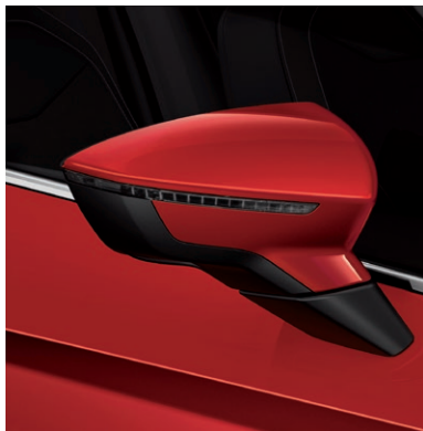
Desire Red 2