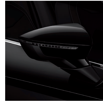
Midnight Black 2