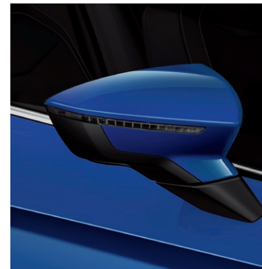
Mystery Blue 2