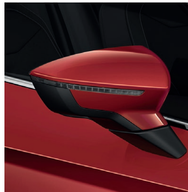
Emocion Red 1