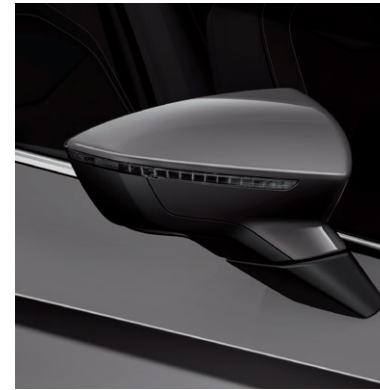
Magnetic Grey 2