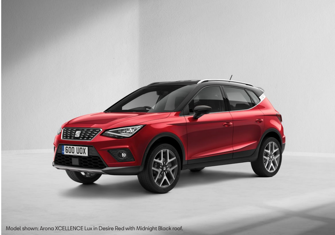
Model shown: Arona XCELLENCE Lux in Desire Red with Midnight Black roof.