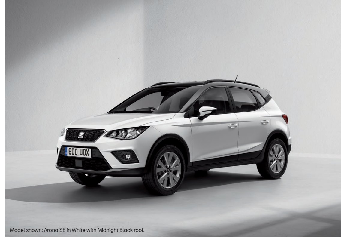
Model shown: Arona SE in White with Midnight Black roof.

The SEAT Connect services can be operated only by using available public communication technologies. Please note that due to development of these technologies, especially mobile networks, SEAT cannot guarantee consistent availability in all countries for the duration of SEAT Connect services. Possible changes in technology may cause permanent unavailability of them.