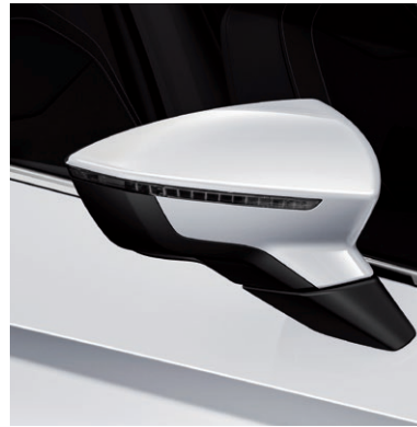
Nevada White 2