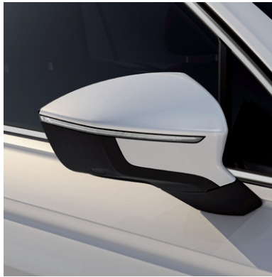
Oryx White 2

Print and screen view do not provide an exact representation of colour. Please refer to the paint colour moulds at your local SEAT Retailer.