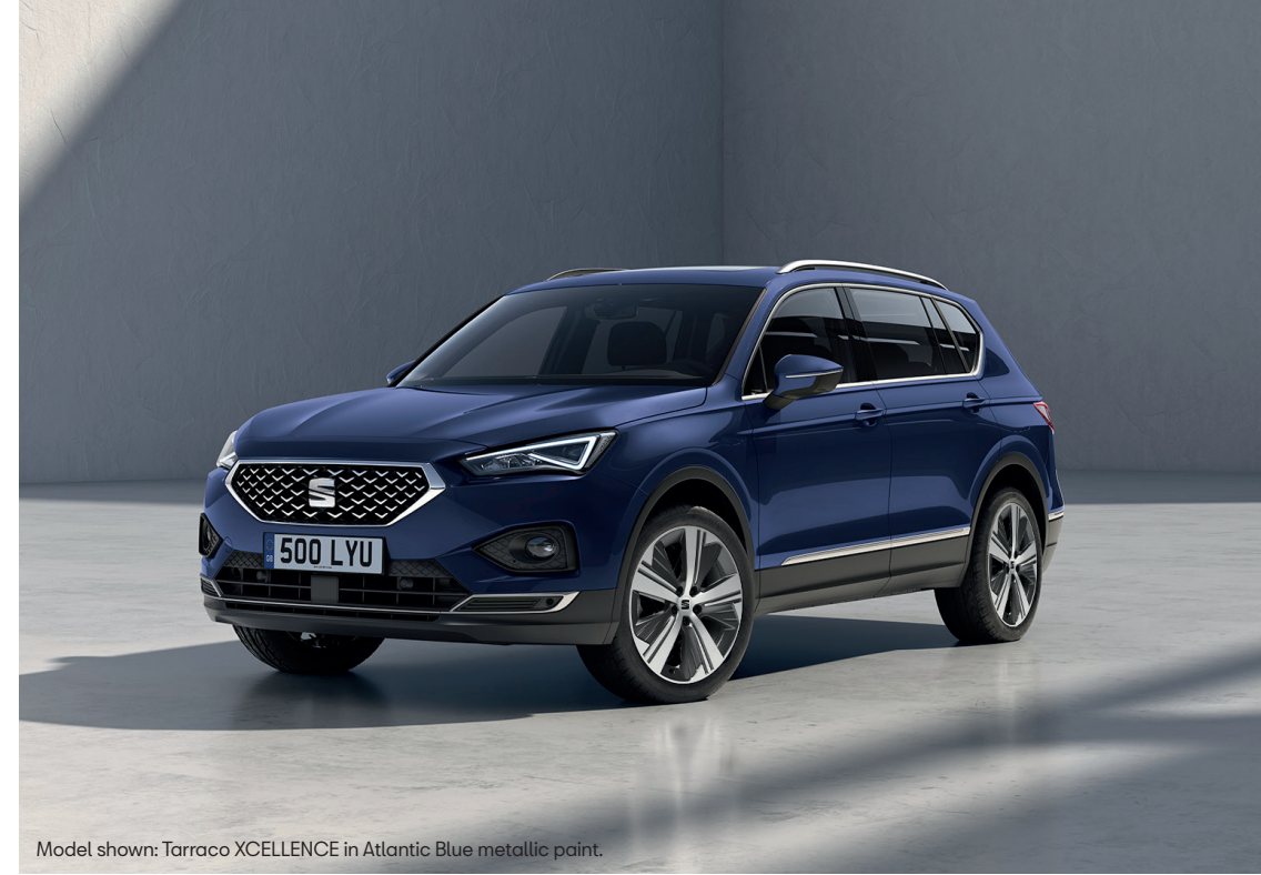
Model shown: Tarraco XCELLENCE in Atlantic Blue metallic paint.

02. Baza Grey cloth with brown Alcantara.