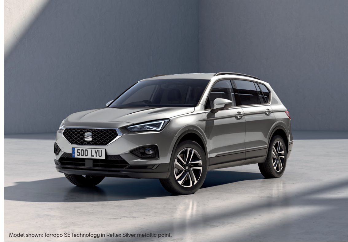
Model shown: Tarraco SE Technology in Reflex Silver metallic paint.

6 The SEAT Tarraco. Pricing and specification list.