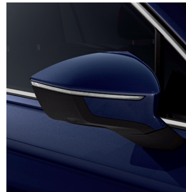
Atlantic Blue 2