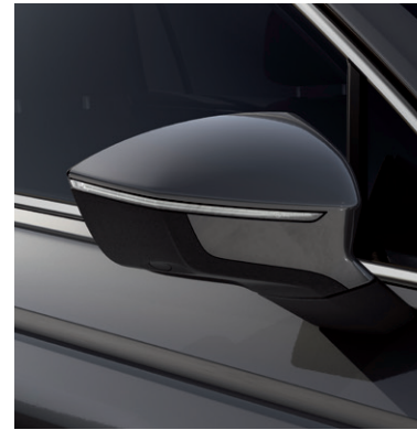
Urano Grey 1