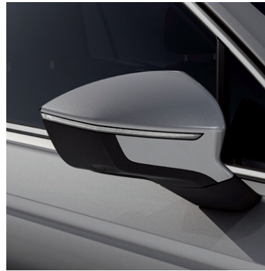
Reflex Silver 2