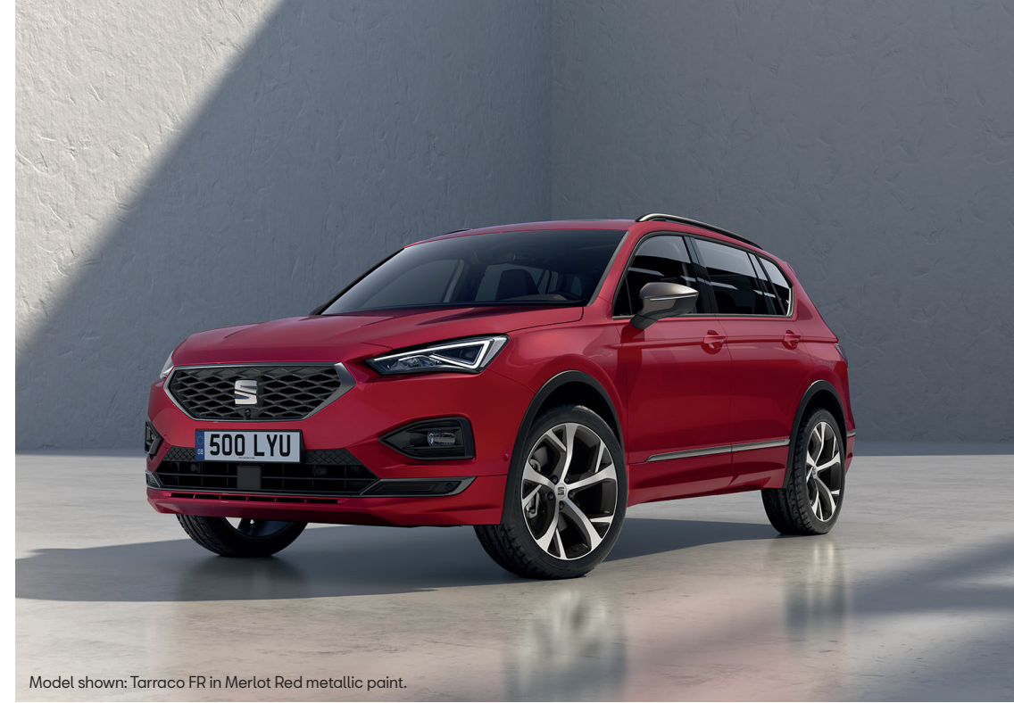
Model shown: Tarraco FR in Merlot Red metallic paint.

*Price is for Tarraco FR 1.5 TSI EVO 150PS.