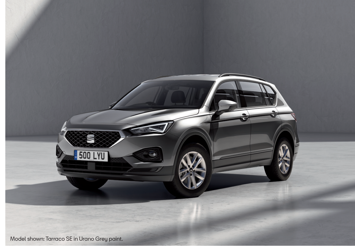
Model shown: Tarraco SE in Urano Grey paint.