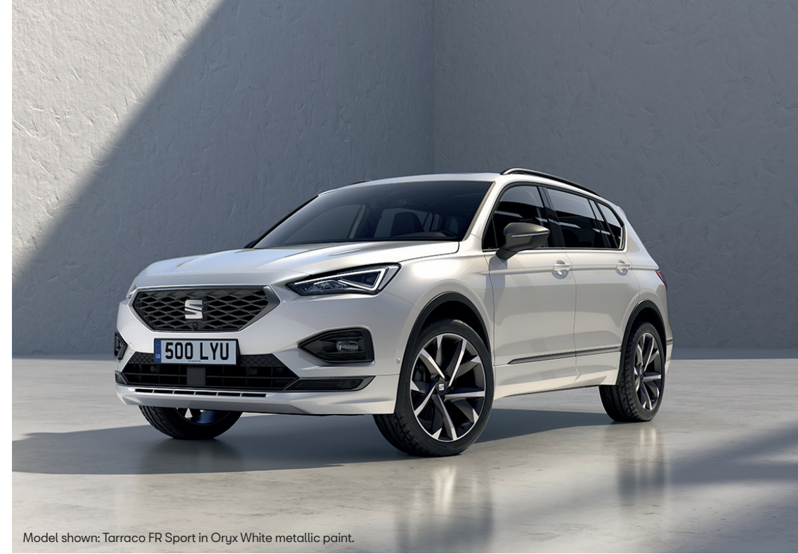
Model shown: Tarraco FR Sport in Oryx White metallic paint.