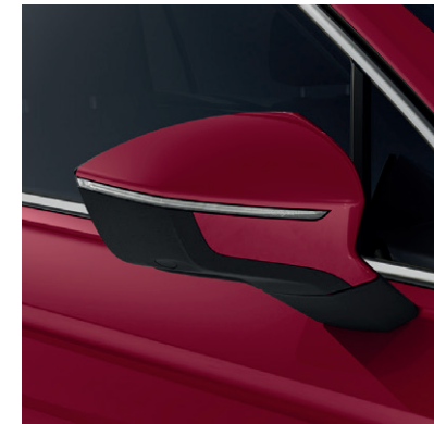
Merlot Red 2