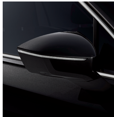
Deep Black 2