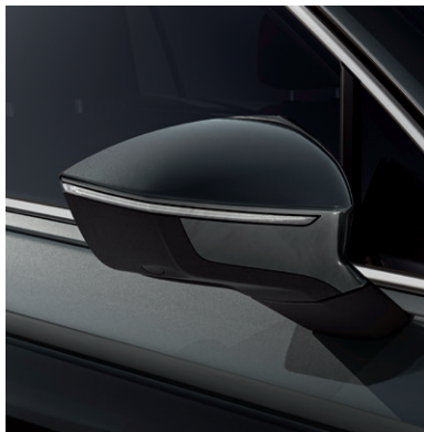
Dark Camouflage 2