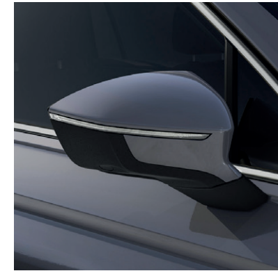
Dolphin Grey 2