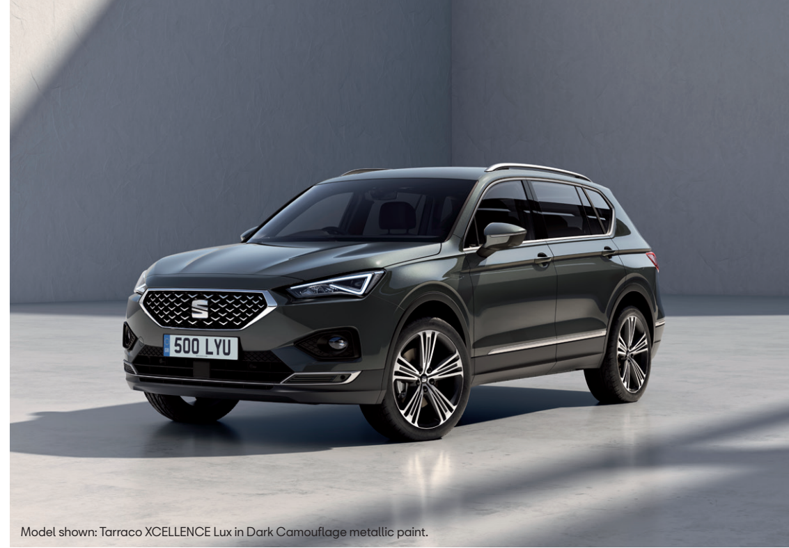
Model shown: Tarraco XCELLENCE Lux in Dark Camouflage metallic paint.

10 The SEAT Tarraco. Pricing and specification list.