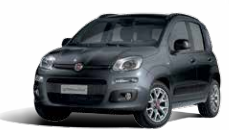
446 ANTARACITE GREY