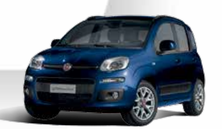
567 MEDITERRANEAN BLUE