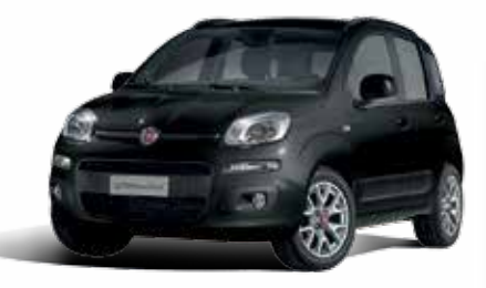
601 DARKWAVE BLACK