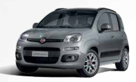
785 MINIMAL GREY