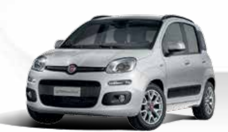
565 ACTIVE GREY