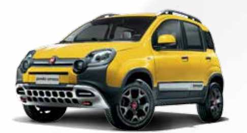
509 TROPICALIA YELLOW