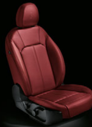
Red leather with red lower dashboard and door panels