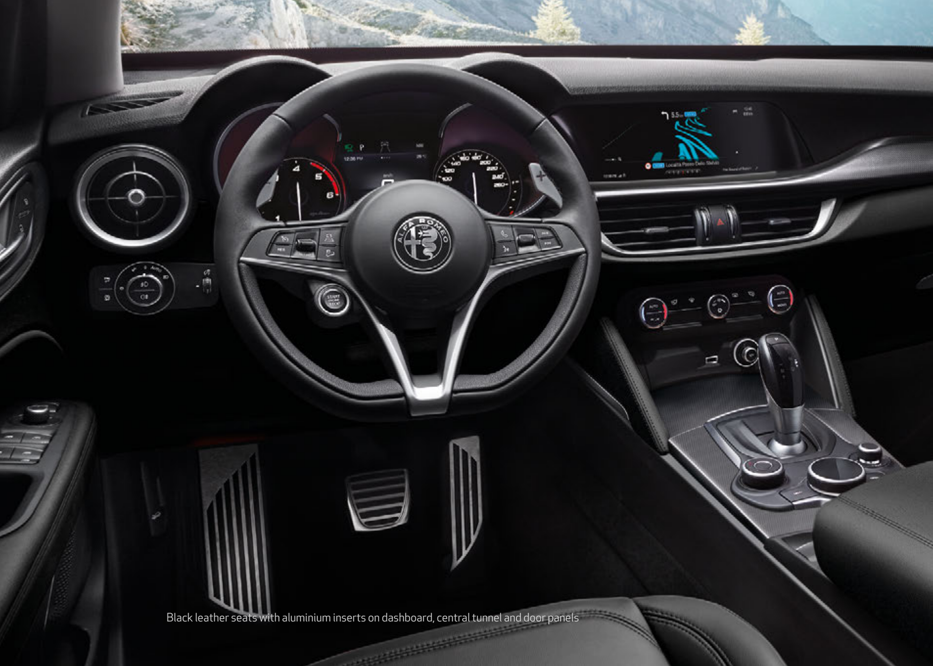
Black leather seats with aluminium inserts on dashboard, central tunnel and door panels