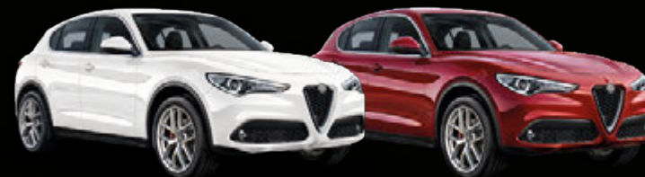
Trofeo White (Available on Ti version only)