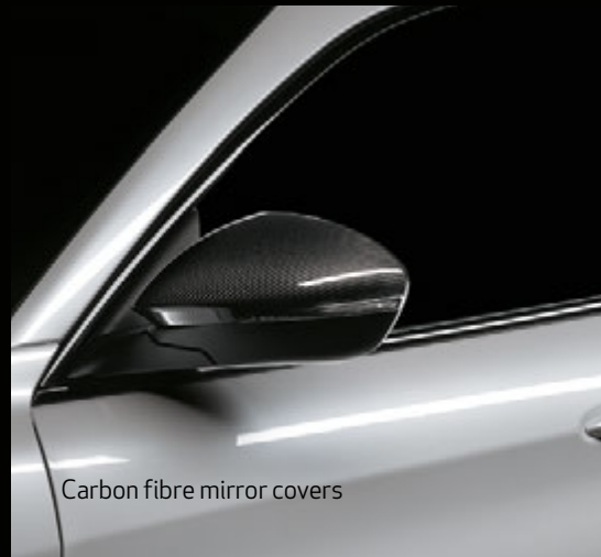
Carbon fibre mirror covers