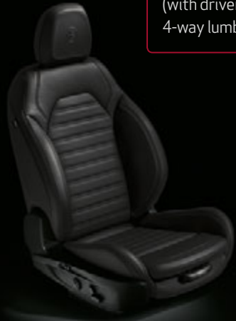
Black leather sports seats

Heated leather sports seats Heated leather sports steering wheel 6-way front power seats (with driver memory) 4-way lumbar adjustment