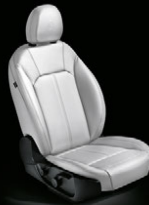
White leather with white lower dashboard and door panels