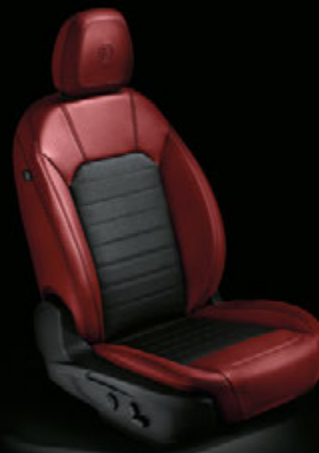
Black cloth with Red leather surround