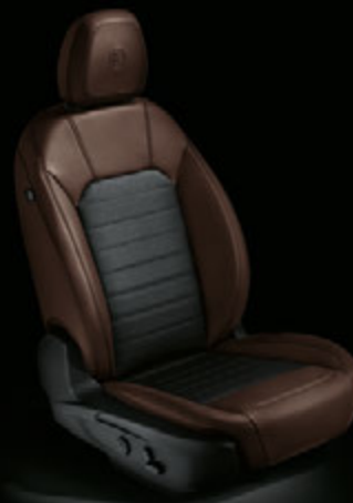
Black cloth with Mocha leather surround