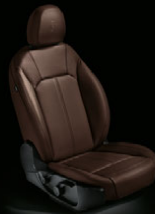
Mocha leather with mocha lower dashboard and door panels