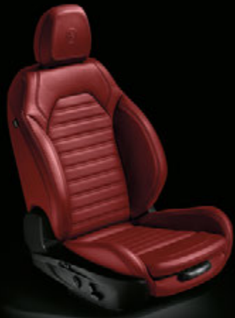
Red leather sports seats