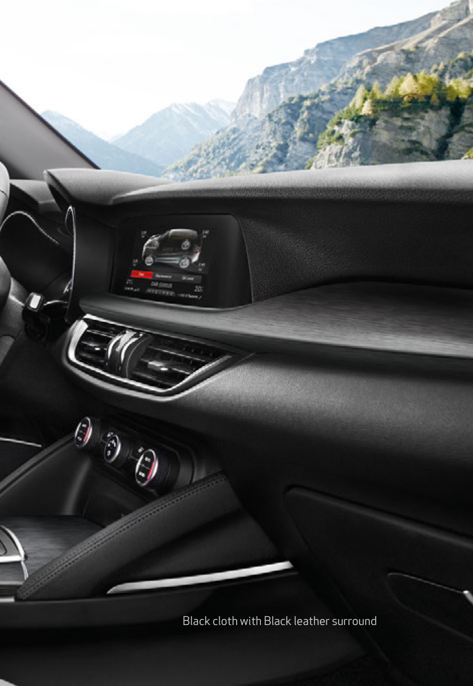
Black cloth with Black leather surround