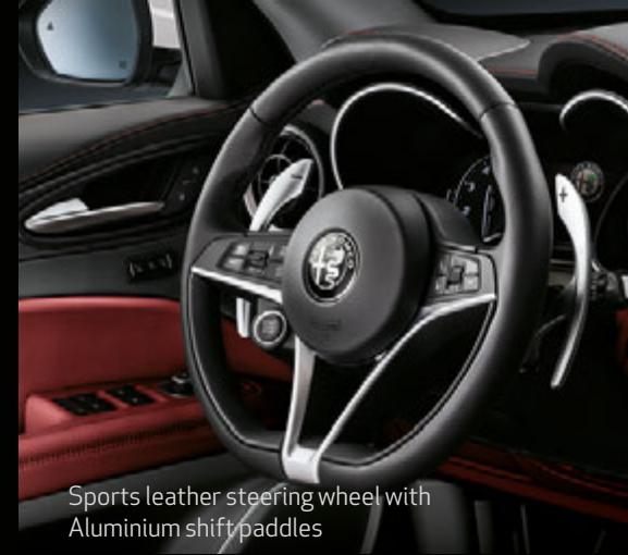
Sports leather steering wheel with Aluminium shift paddles