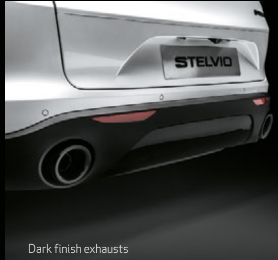
Dark finish exhausts