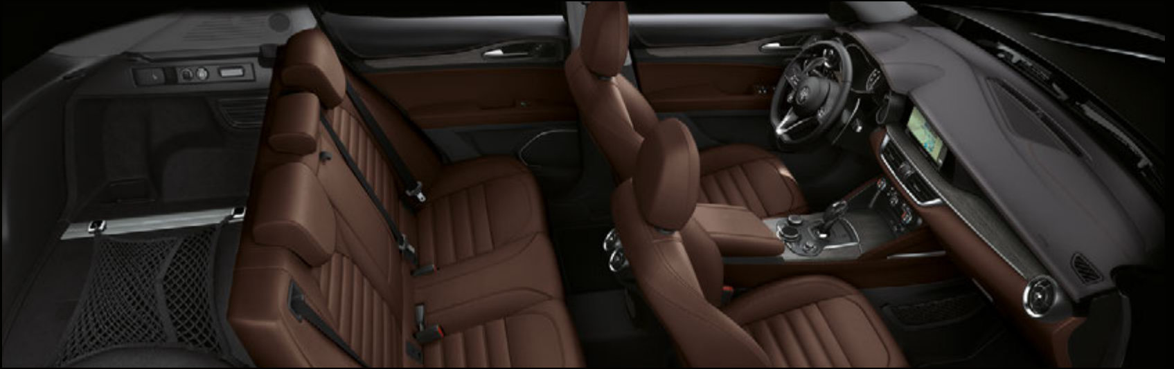
Mocha leather dashboard with Silverwood - Mocha leather