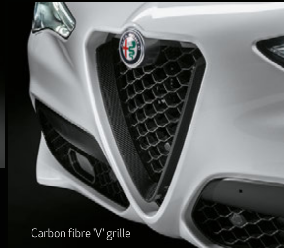
Carbon fibre 'V' grille