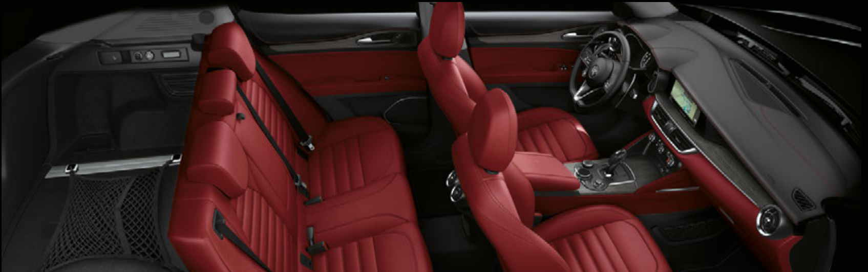
Red leather dashboard with Silverwood - Red leather