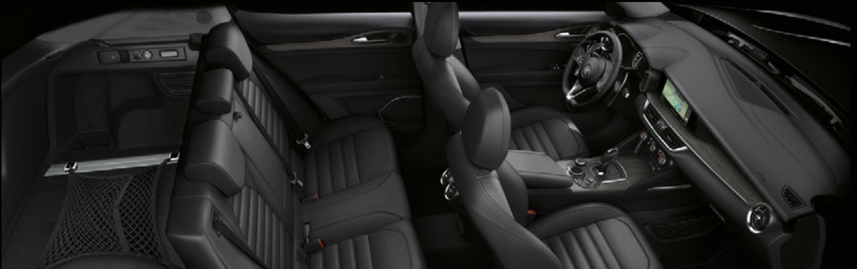
Black leather dashboard with Silverwood - Black leather