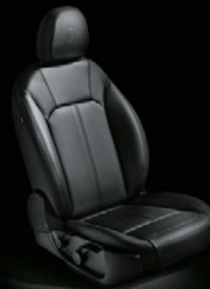
Black leather with white lower dashboard and door panels