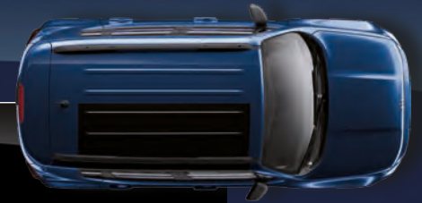
Jetset Blue Metallic