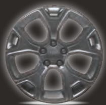
18" ALUMINIUM WHEEL