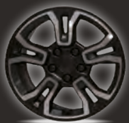
16" ALUMINIUM WHEEL