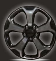
17" ALUMINIUM OFF-ROAD WHEEL