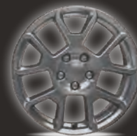
17" ALUMINIUM WHEEL