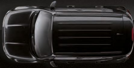
Carbon Black Metallic