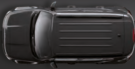
Granite Crystal Metallic